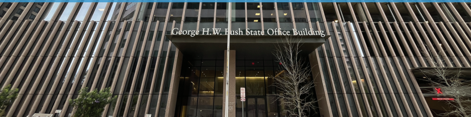
George H.W. Bush State Office Building